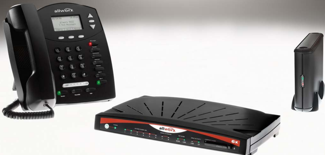
The Allworx 6x System, shown with Allworx 9102 and optional USB hard disk.